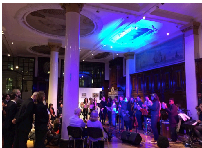
The Brazilian Ambassador invited our students to perform at the Brazilian Embassy where they played to an audience of over 200 guests.