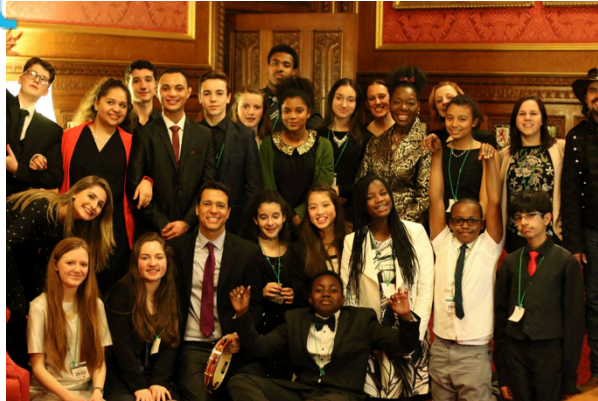
Our students and Brazilian Artists in Residence after their fantastic performance at the Speaker's House in the House of Commons.

"I have just five words; every child should do this!" Sir Richard Stilgoe