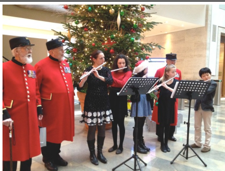
A big thank you to all our students who gave so many people joy by volunteering to play over Christmas.

We have already received a lot of thank you letters from the pensioners' forums all with really positive feedback on how much they enjoyed the day."