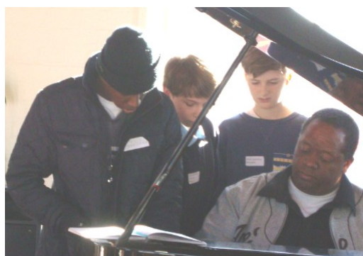
An unforgettable learning experience that our students at the World Heart Beat Music Academy receive—where else does this happen?

"It is a dream to meet your musical hero's just once in your lifetime, but at the WHB you seem to be around them all the time" It is just such a great place to be."