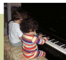
The next generation of cool musicians

The event is FREE. —Enrol now by submitting an application form available online at www.hmdt.org.uk